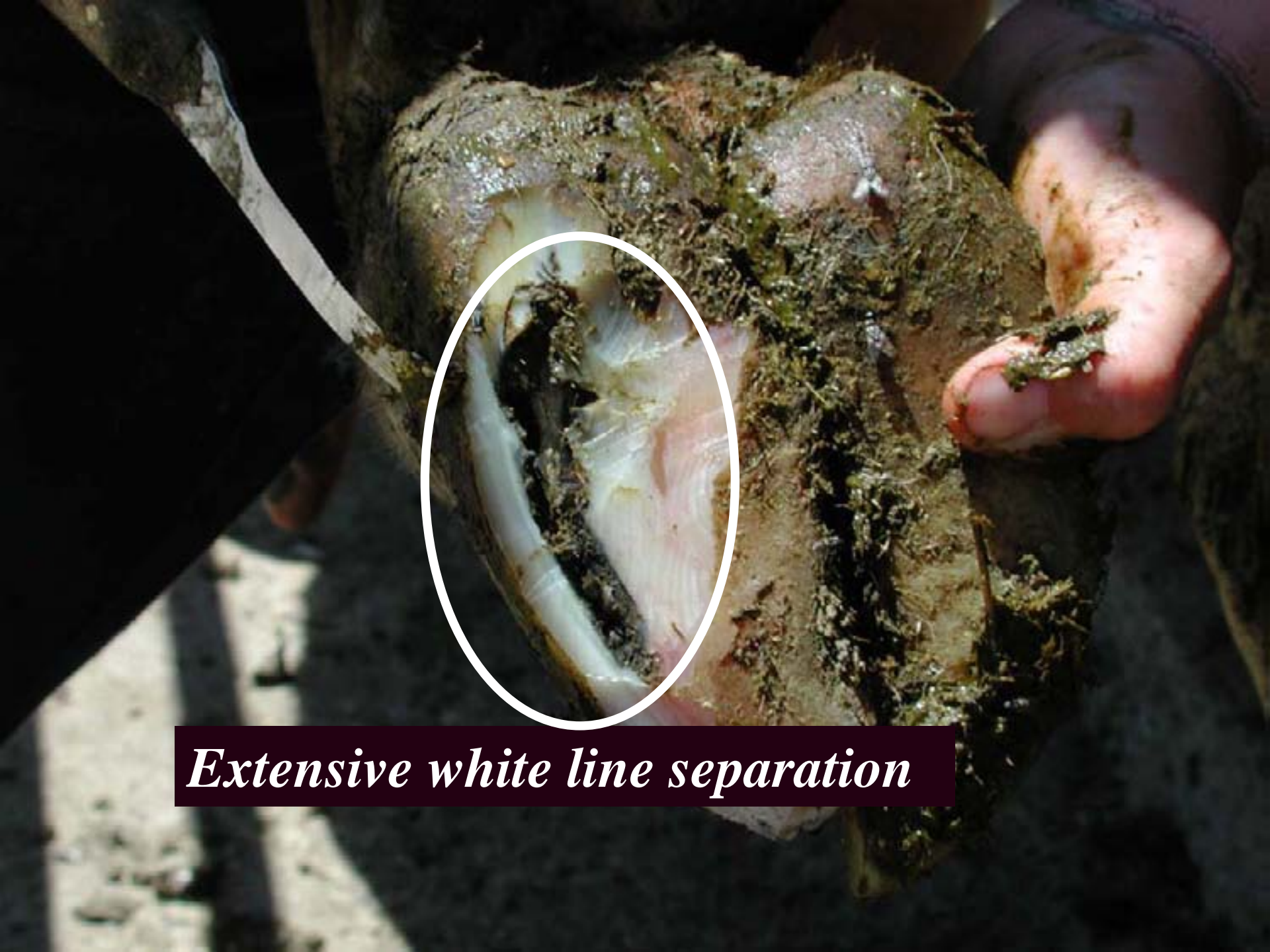
Extensive white line separation