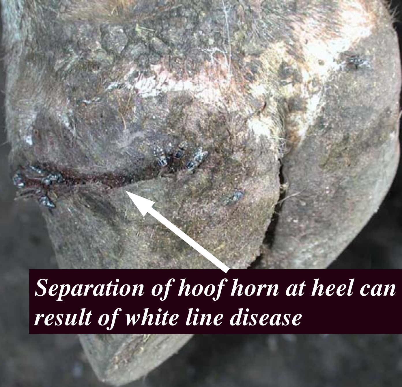
Separation of hoof horn at heel can be a result of white line disease