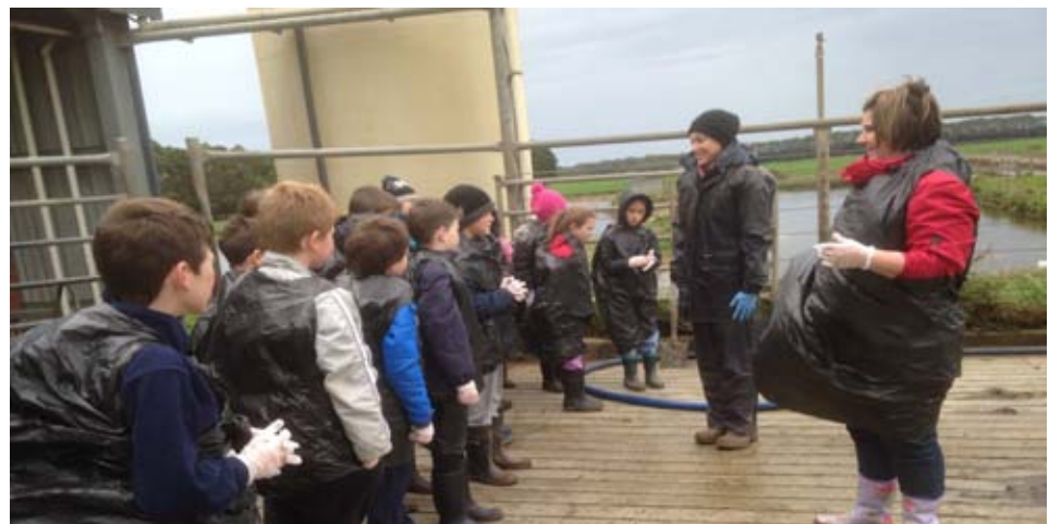
Timboon Agriculture Project's "TAP into Farm Science" excursion