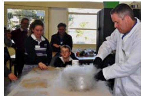
Students making ice cream