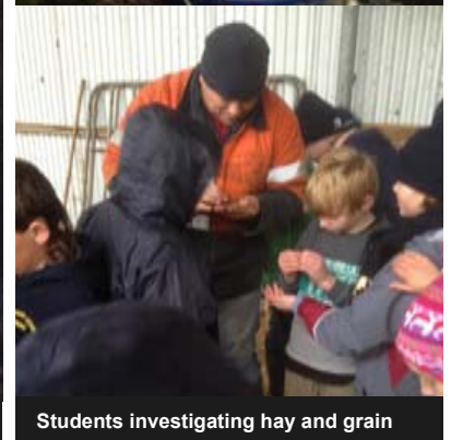
Students investigating hay and grain