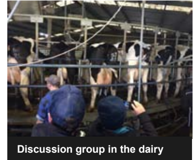
Discussion group in the dairy

Ballarat Discussion Group, the NSW farmers and Wrightson Seeds staff also met for dinner where there was extensive discussion about the similarities and differences in operating dairy businesses in the Ballarat and mid NSW coast regions.